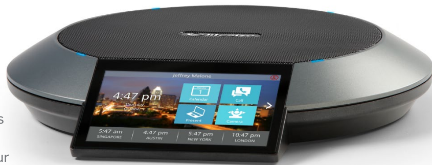
Large display with easy-to-use, touchscreen interface

Lifesize Phone HD is a beauty. A large, dramatic interface provides rapid access to the most popular features. The UI is inspired by the best UIs in the mobile space, customer testing and market feedback (you spoke; Lifesize listened). Every pixel has a purpose. Elements are logically placed on each screen, and predictive actions get users into their call and conducting the business of the meeting quickly. With its vivid and responsive touchscreen, Lifesize Phone HD delivers a clearly engaging video communication experience.