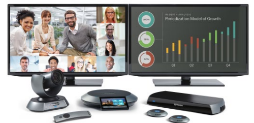
Lifesize® Icon 600™ with optional two-display configuration for screen sharing, Lifesize® Camera 10x™, plus Lifesize Digital MicPods attached to Lifesize Phone HD for large rooms.

*Not applicable with Lifesize® Icon 400™ or Lifesize® Icon 450™